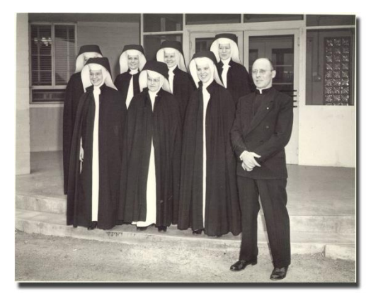
Rose de Lima Campus on opening day, 1947

As the community's only not-for-profit, faith-based hospital system, the St. Rose Dominican hospitals are guided by the vision and core values of the Adrian Dominican Sisters and Dignity Health.