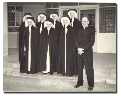
Rose de Lima Campus on opening day, 1947

As the community's only not-for-profit, faith-based hospital system, the St. Rose Dominican hospitals are guided by the vision and core values of the Adrian Dominican Sisters and Dignity Health.