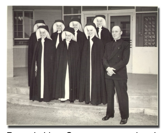
Rose de Lima Campus on opening day, 1947

As the community's only not-for-profit, faith-based hospital system, the St. Rose Dominican hospitals are guided by the vision and core values of the Adrian Dominican Sisters and Dignity Health.